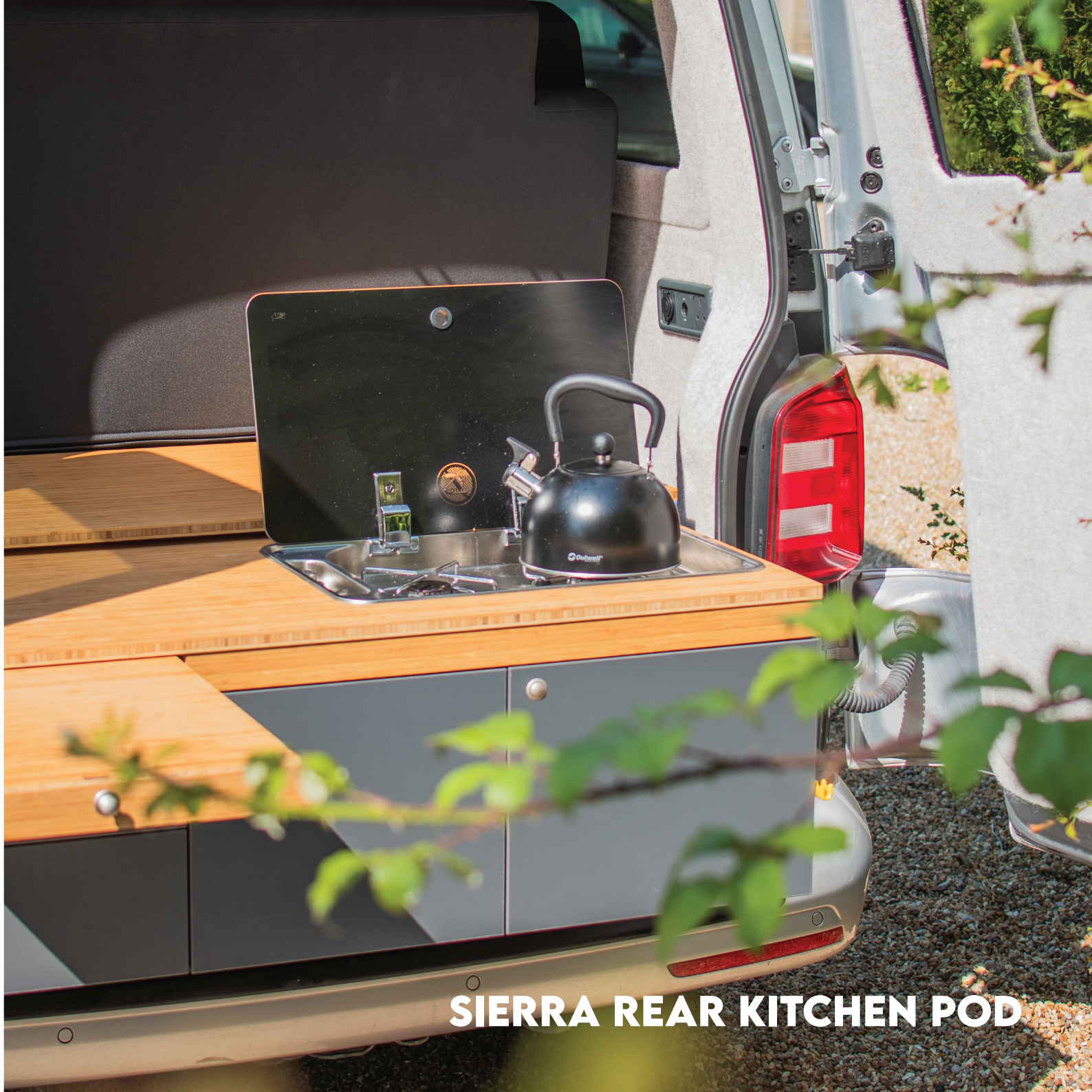
SIERRA REAR KITCHEN POD